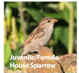
Juvenile/Female House Sparrow

The juvenile/female House Sparrow (right) is much like the male but has a drab brown head and slightly paler bill.