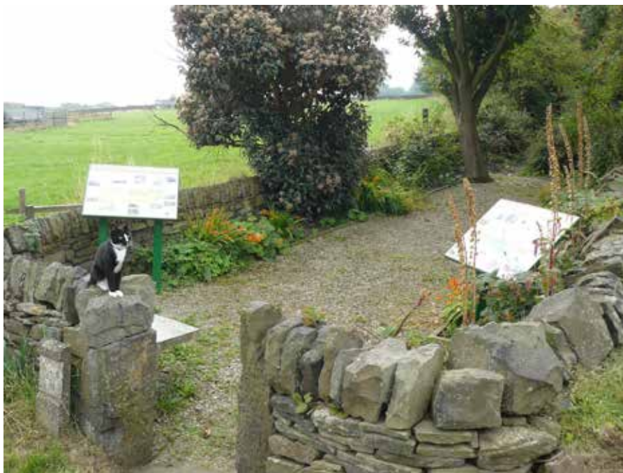
Green Moor Village Garden