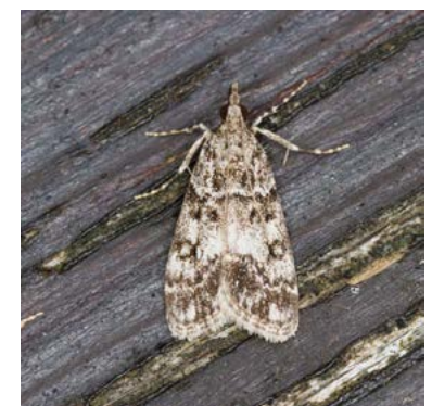
Lease Black Arches