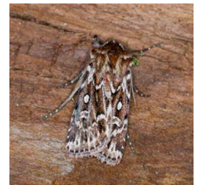
True Lovers Knot