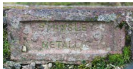
Barnsley Metallic bricks

Initially sheltered by trees, you progress onto moorland, before returning to the start point. Full details are available from Stocksbridge Walkers are Welcome http://www.stocksbridge-walkers.org.uk/ Short walk, S1