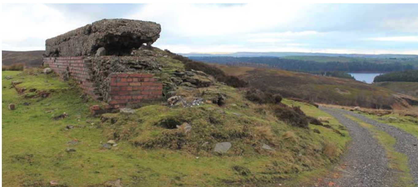
The remains of a WW2 target training winch house with Langsett Reservoir in the distance