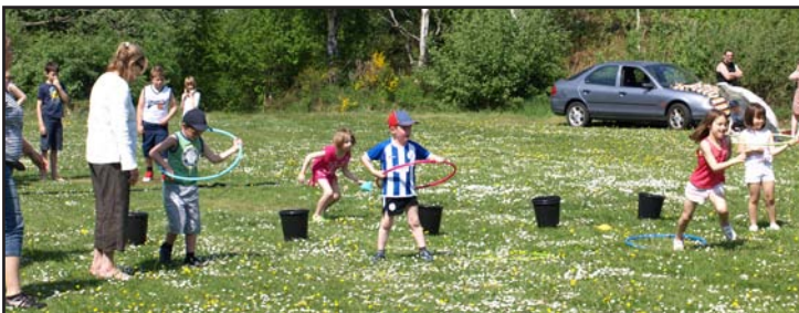
Now what were these buckets for?

It seems like such a long time ago... actually it was! Way back in summer Green Moor's Sunday School held their annual sports day on the Delf.