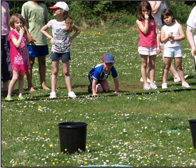
Young ones lining up. The photographer's grandson centre stage