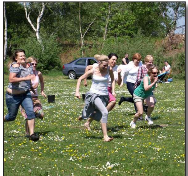
Mums go for the winning line.