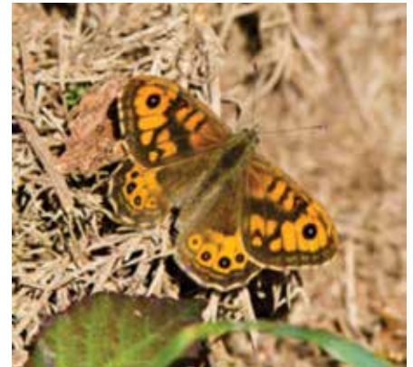
Wall Butterfly

Nature report visit here: www.rspb.org.uk/forprofessionals/science/research/details.aspx?id=363867