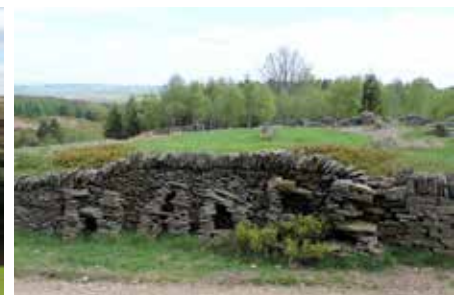
Wall at Hades