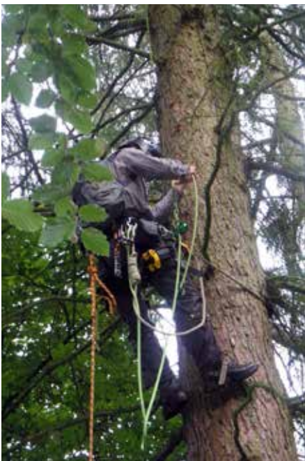
The Peak District Raptor Monitoring Group climber collecting evidence for the police