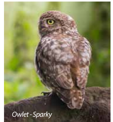
Owlet - Sparky