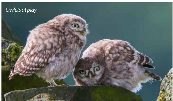
Owlets at play