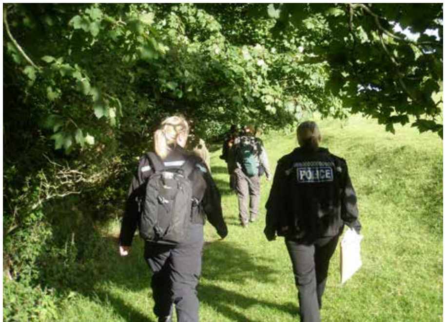
Police collecting evidence