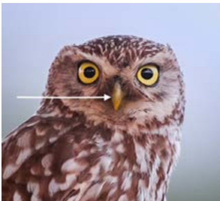
Female Little Owl