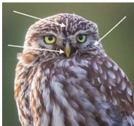
Male Little Owl