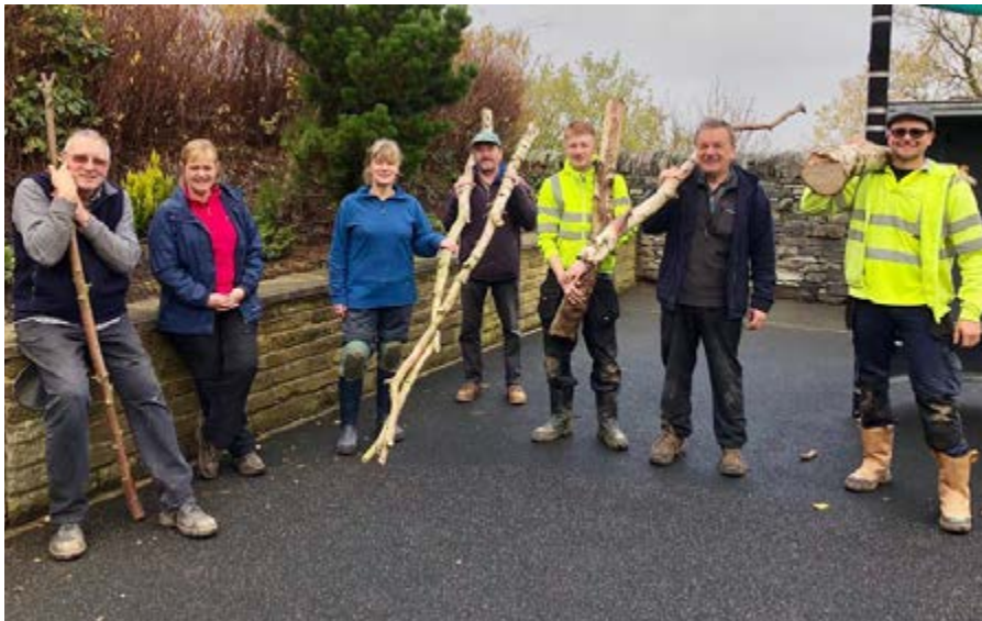
Team Green Moor with Twiggs Penistone Area Clean Green and Tidy Team

A difficult one to follow for this coming year! However, amongst the plans for this year the team's new big project will be looking at creating an interactive trail. This will include maintaining what has already been achieved but creating a route through the village which will take you from the playground, along to the telephone